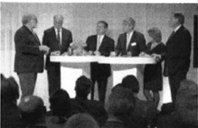
We Are Tomorrow DOW Jubilee Symposium