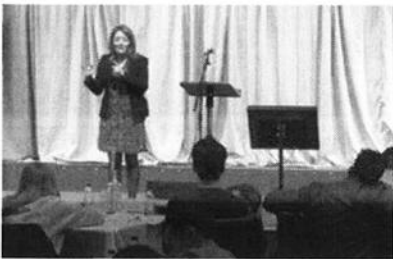
European Political Strategy Centre EPSC ESPAS Conference 2018