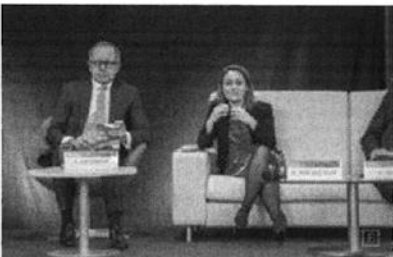
The Future of Health Systems Oxford, Said Business School