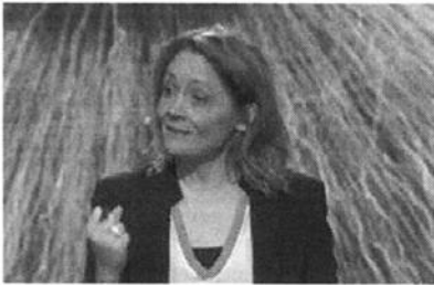
"Le futur n'est pas de la fiction" Keynote Radio Canada Conference