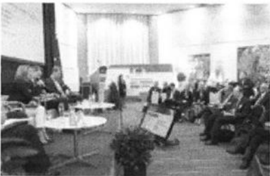
The Future of Business and Corporations: Value Creation in the Digital Age ESPAS Conference, European Commission